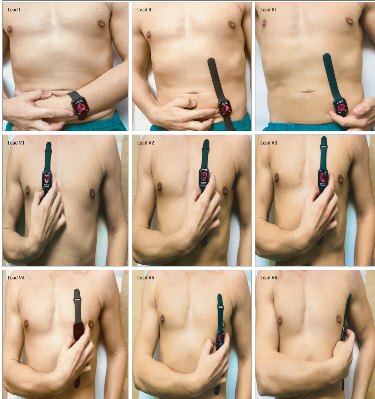
Figure 1. The Positions of the Smartwatch to Obtain 9-Lead Electrocardiograms (ECGs)

The multiple-lead ECG with the smartwatch was obtained as follows: lead I was recorded without the removal of the smartwatch on the left wrist using the right index finger on the crown. The recording of other leads required the removal of the watch and proper placement at appropriate abdomen and chest locations. Lead II was obtained with the watch on the left lower abdomen and the right index finger on the crown, and lead III was obtained with the watch on